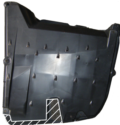
TRIM UNDERBODY PANEL TRIM DIAGRAM