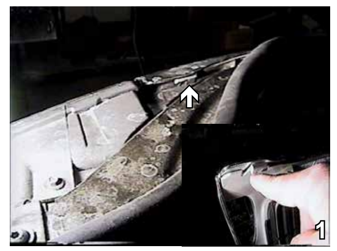
1. Lift the top edge of the fascia with the flat screwdriver to release the four clips.

The BX8869 Bulb and Socket Wiring Kit is recommended for this vehicle.