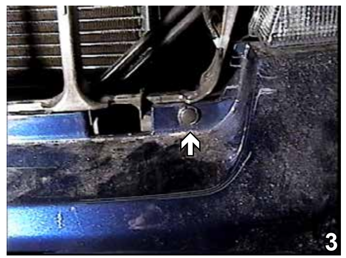
3. Remove four pushpins from the top edge of the metal bumper. Set the pushpins aside to be reinstalled later.