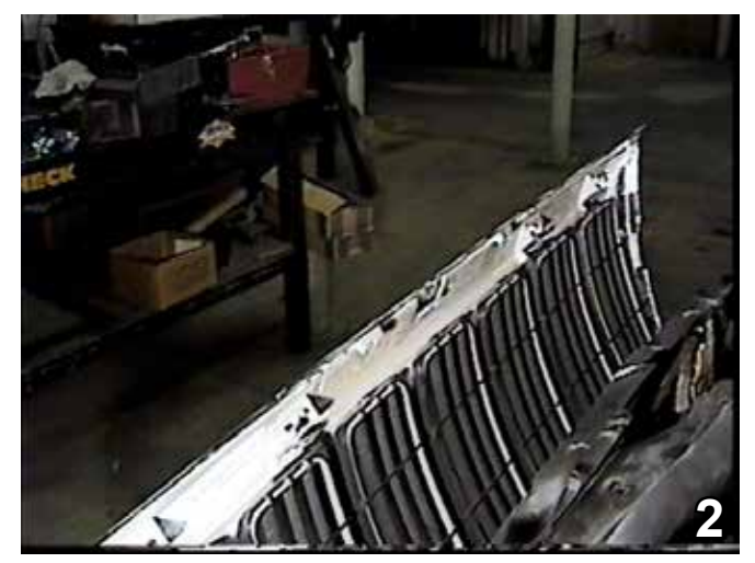
2. Pull the fascia forward and lift up to remove. Set the fascia aside to be reinstalled later.

Handling of some cosmetic parts when installing this product may require the use of protective covers, rags, specialty tools, etc. to prevent damage.