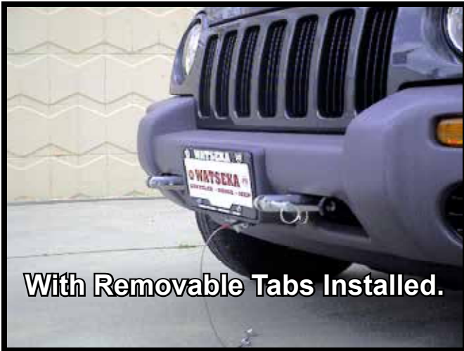
With Removable Tabs Installed.

Be certain the user receives the instruction sheets for their products.