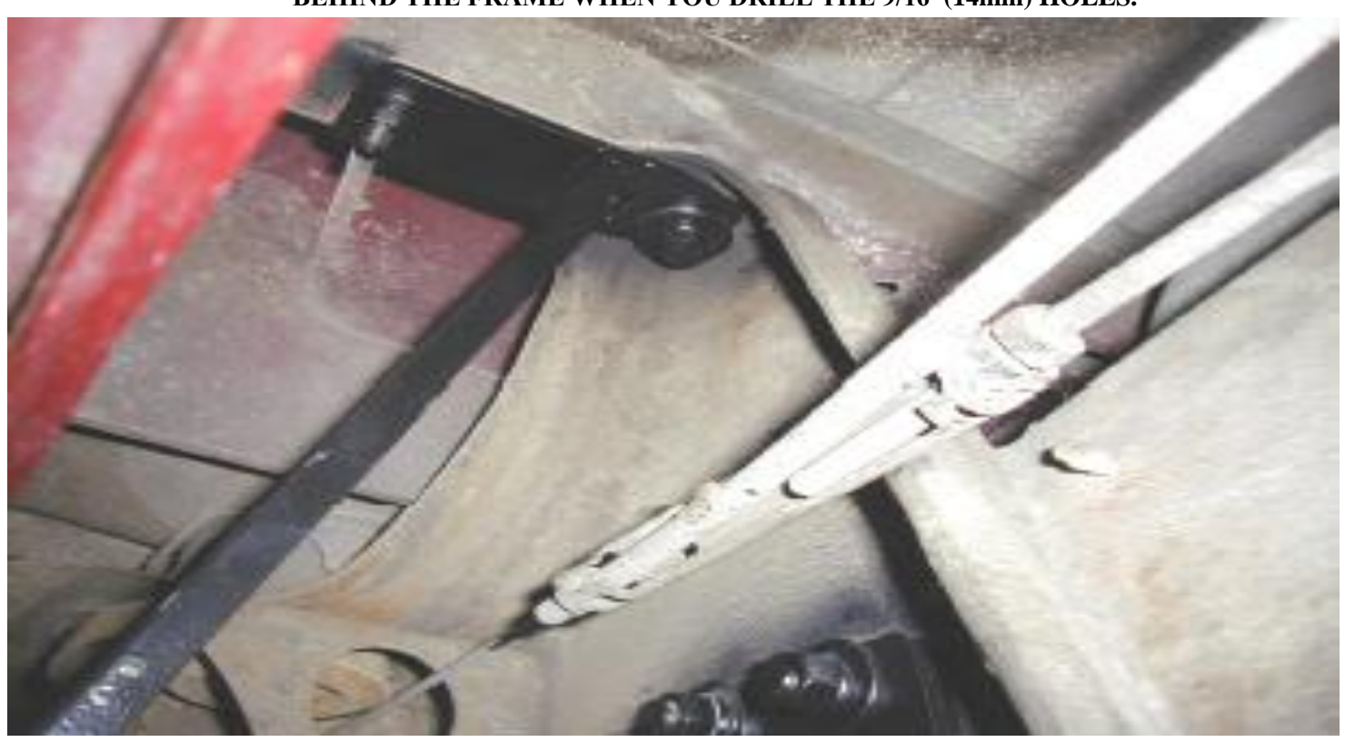
UPPER SUPPORT INSTALLED W/ FACTORY BOLT. 7/16"(11mm) HOLE DRILLED, AND BOLT FISHED IN. ILLUSTRATED DIAGRAMS (CONTINUED)

CAUION: 1" CLEARANCE MUST BE MAINTAINED TO AVOID BED DAMAGE