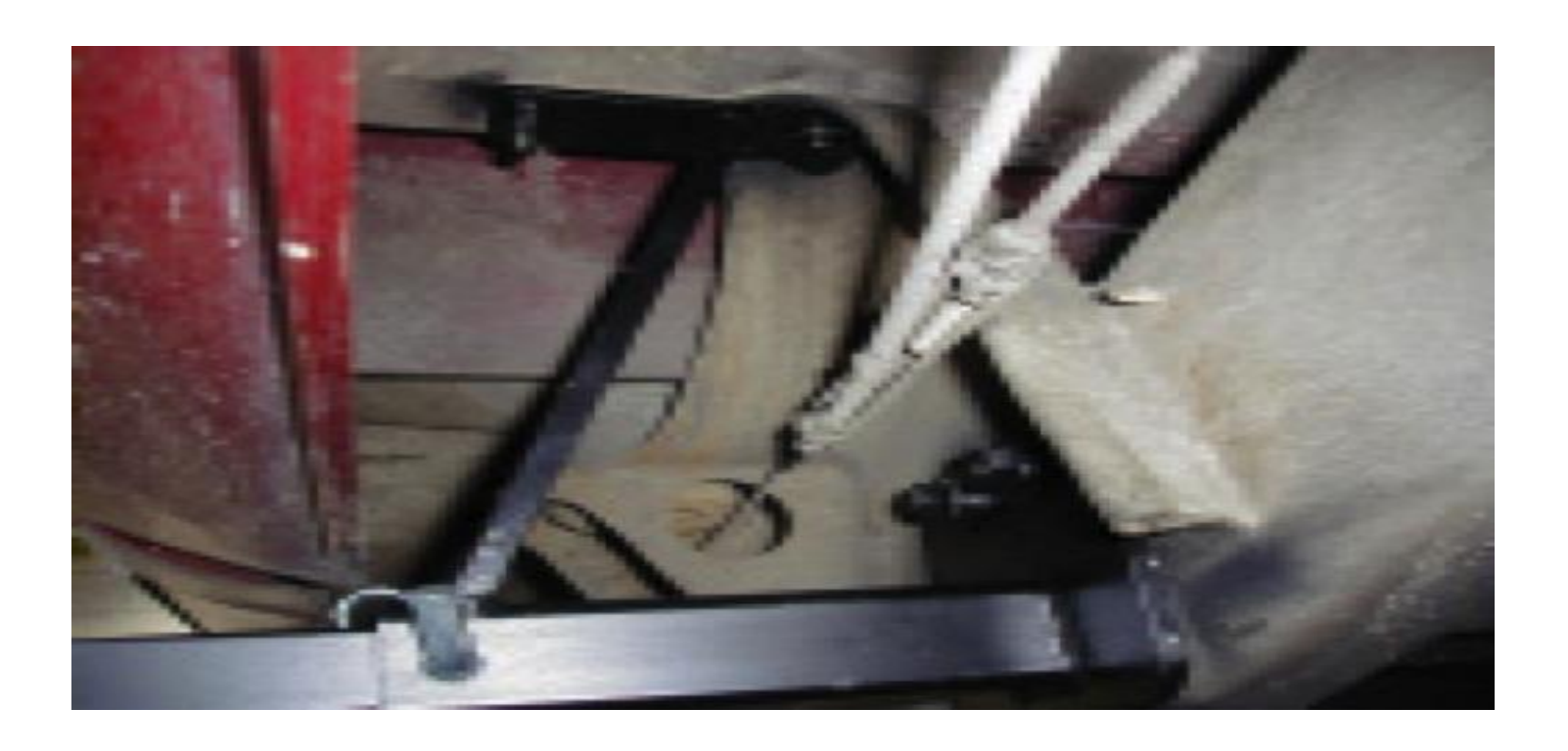
PROPER BOLT ASSEMBLY