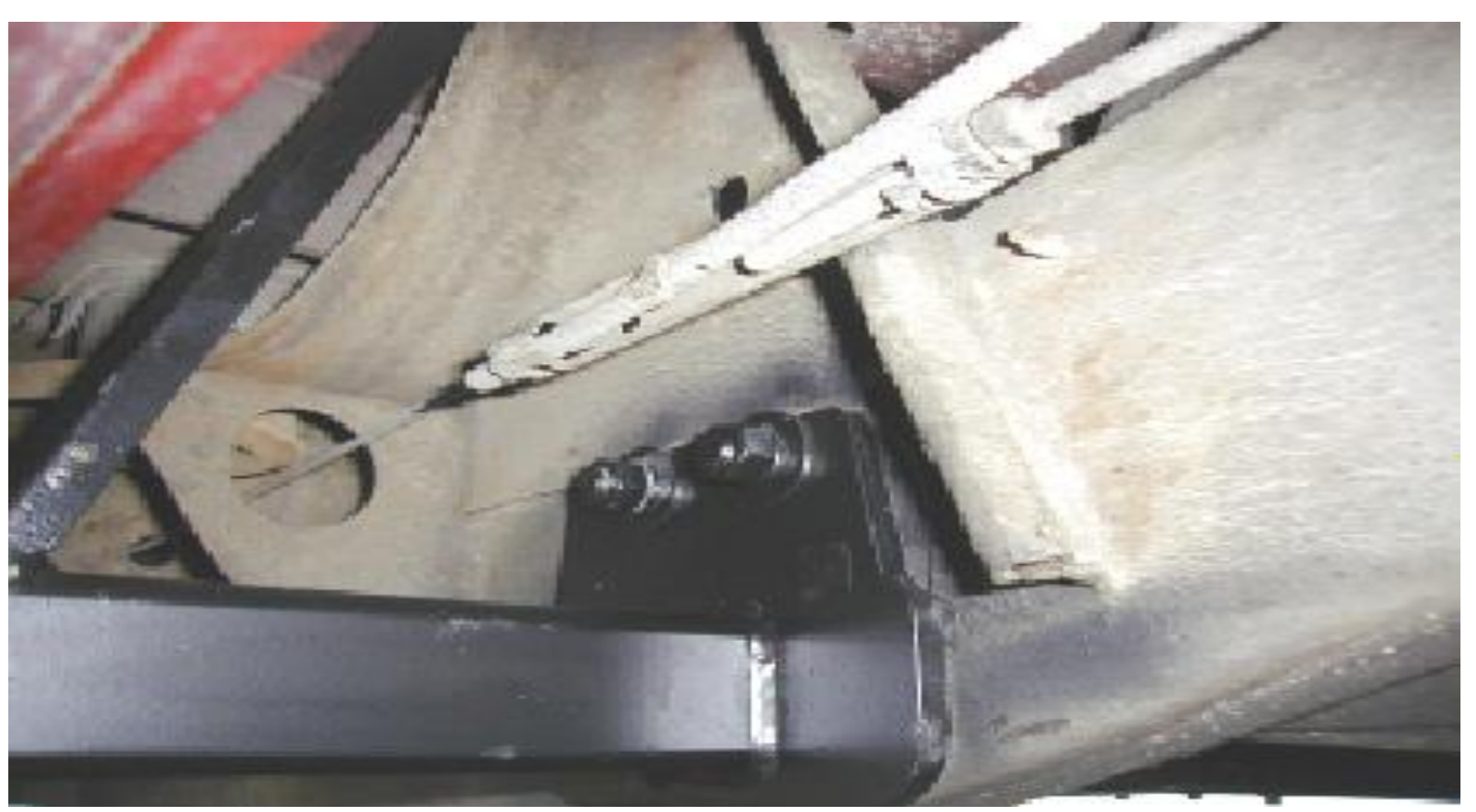
CAUTION: THERE MAY BE FUEL LINES OR WIRE HARNESSES BEHIND THE FRAME WHEN YOU DRILL THE 9/16"(14mm) HOLES.