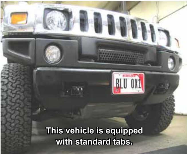
This vehicle is equipped with standard tabs.

Be certain the user receives ALL technical documentation for their products.