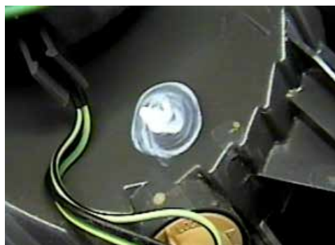
Location for the BX8869 is on the bottom side of upper lens.