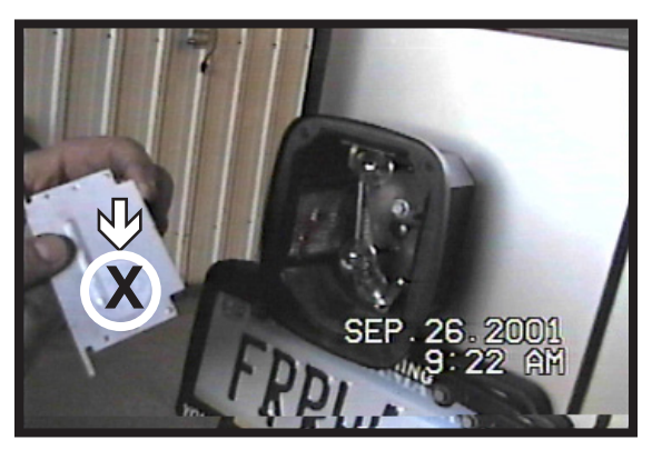
Drill a hole according to the tail light wiring kit instructions.

The BX8869 Tail Light Wiring Kit is recommended for this vehicle.