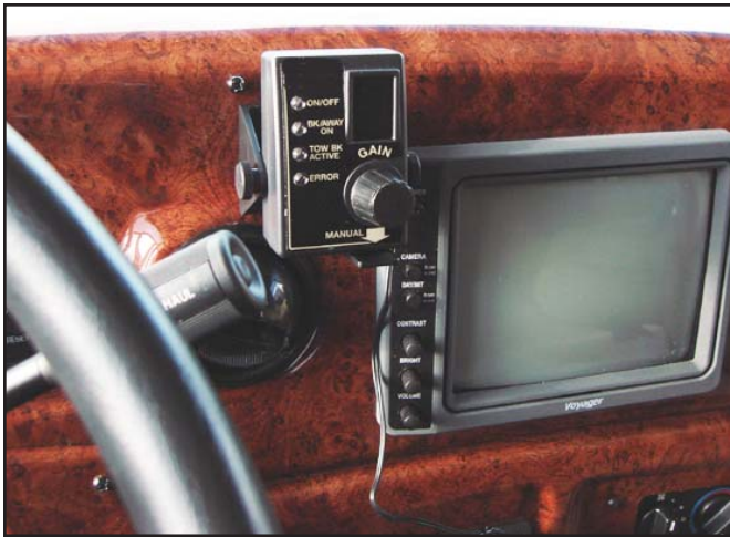
Fig. 5 RF in-coach controller mounted on dashboard