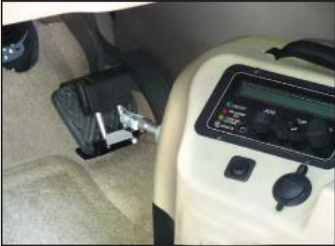
Fig. 1 Place claw on brake pedal

Note: The easiest way is to place the bottom of the claw under the pedal first, then slide the top of the claw over the top of the pedal.